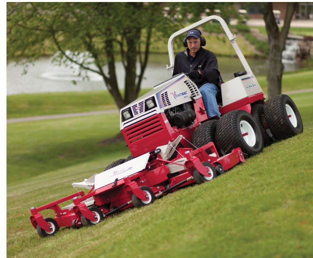
The new Ventrac 4500 tractor is used by landscapers, municipalities, churches, universities, golf courses, homeowners, parks, sport facilities, shopping malls, tree growers, rental yards, nurseries and airports.

Venture used 2D AutoCAD® software from Autodesk for many years. With a power